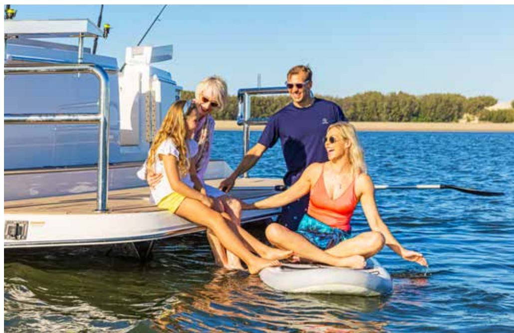
Right: The expansive high-low swimplatform has the size and safety for the whole family to enjoy watersports.

and fishing platform, there's an optional three-seater transom lounge or livebait well, and an optional awning extending from the hardtop. The cockpit also comes with a fridge/freezer and a double Southern Stainless barbecue, plus triple hatch access in the teak sole.