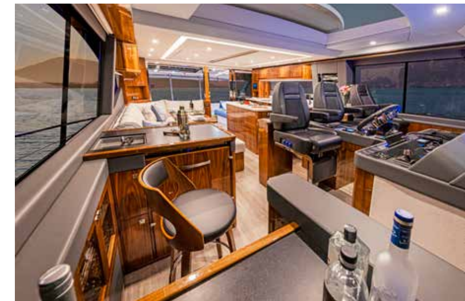
Below: In this example, the starboard space alongside the helm has been configured as a cocktail bar. Cheers!