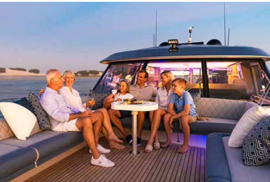
Below: The 645 SUV is available in Classic or Newport variants, the former featuring a superb foredeck entertaining area.

If you're into watersports and fishing, you'll feel at home on the 645 SUV. A rise and fall hydraulic swimplatform doubles as tender storage